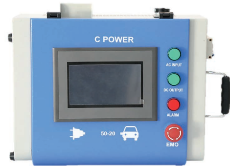
10 kW DC mobile charging station