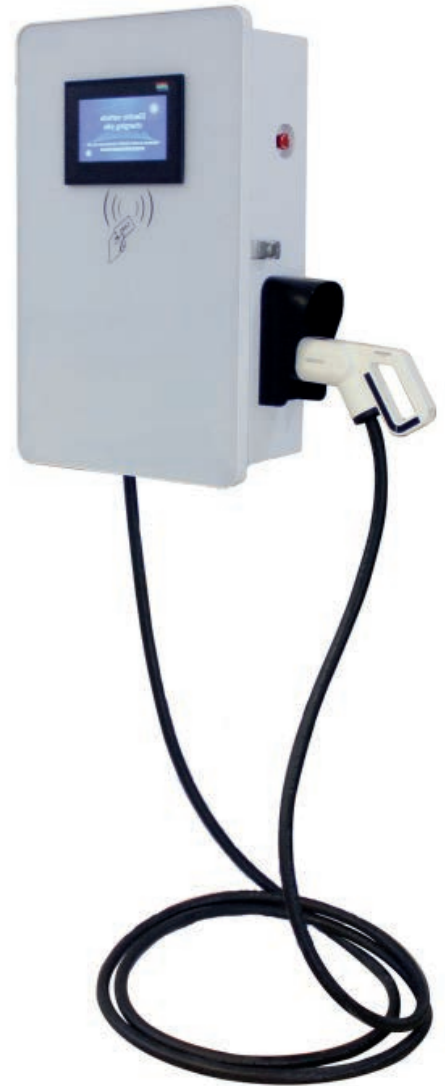
1x or 2x 3 kW - 1x or 2x 44 kW AC charging station